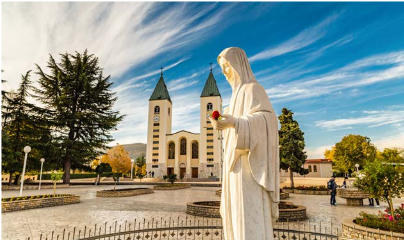
CHURCH OF ST. JAMES - MEDJUGORJE