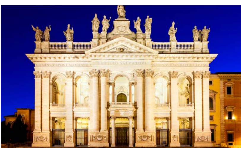
ST. JOHN LATERAN - ROME